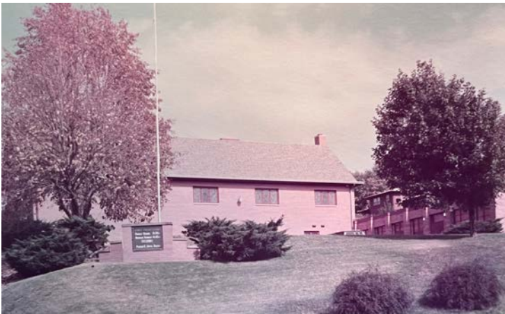
The east side where the parking lot is now.