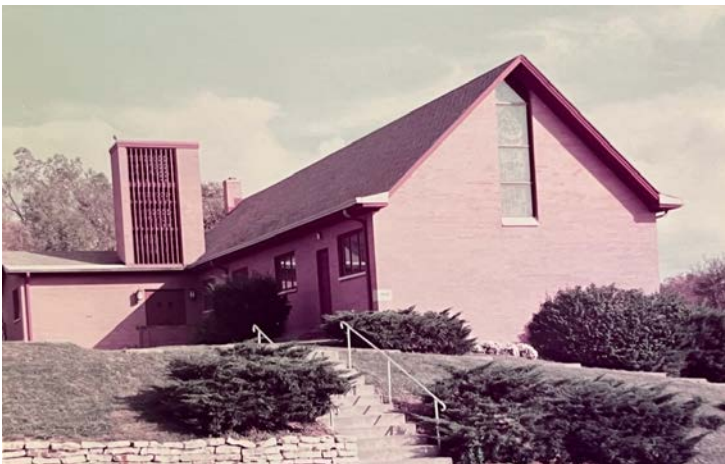
North side – main entrance. The long window is above the choir loft now. The new addition was built inside the “L”