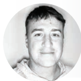
Jeremiah Swann Church Planting